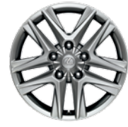
20-in split-five-spoke alloy wheels 34 STANDARD